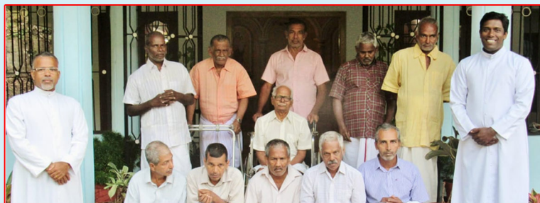
Our Inmates and Fathers at Good News Sneha Bhavan, Kakkoor, Kerala, India.

Contagious diseases like leprosy, AIDS, Cancer etc. Still exist in many parts of our mission. Those affected by these tragic diseases experience deepest dejection and rejection. We strive to help them to live like any other in the society. We care for the lonely, the abandoned aged, regardless of their caste and creed, providing improvement in the quality of their lives.