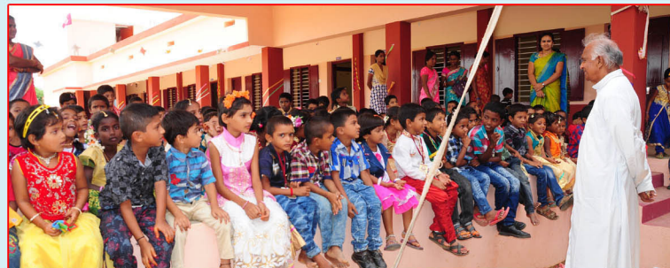
Our School Children in Pathralapadu Mission, Telangana, India