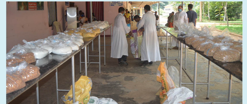
Charitable Relief Works at Good News Retreat Centre, Pampady.

In many villages there is an acute shortage for drinking water. They drink polluted water from lakes and public tanks which are shared by humans and animals alike. But drinking half the year even this is not available. 75% of all diseases are related to unsafe water. $ 5000 would provide a village with a deep bore well and ensure continues healthy drinking water supply.