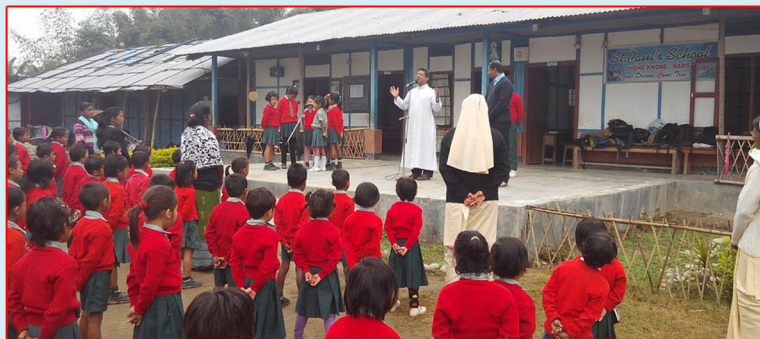
Our School Children in a Tribal Area of Dhona Khona Mission, Arunachal Pradesh, India

Illiteracy is the root cause of most of the physical and social maladies. Rural literacy rates are nearly 20% less than urban rates and rural female literacy is less than 50%. Female children face a lot of neglect and discrimination. You can help us to educate a poor child and give him/her a chance in life.