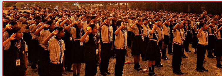
Our Boarding Children in Yernagudem Mission, Andhra Pradesh, India