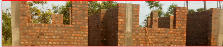
A House Under Construction in our Telangana Mission, India.

For many in the missions even the poor appearance of a house does not exist. Those who somehow or other manage to live with limited income of a long day's work, cannot certainly afford to project for building a proper shelter for themselves. Added to the sufferings of hunger they face the cold weather with scarcely a rag to their backs, and no doors, windows, or even walls to keep off the chilly wind. Our goal is to build shelters for the houseless people. $ 7,000 would give a family a proper shelter.