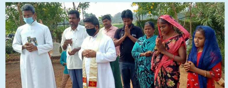
Blessing of the Construction of a House at Telangana