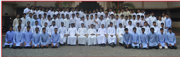
A group of our Seminarians and Priests

The specific purpose of the Society is to promote vocations to the priesthood and to train and supply zealous, dedicated and hard working missionaries wherever there is need in the Church. Thank God we have many vocations. But many of them come from rather poor families that cannot afford the expenses of 12 years of seminary formation. You can give a partial sponsorship for a seminarian with $ 40 for a month; $ 400 for a year and $ 4, 000 for a permanent memorial scholarship.