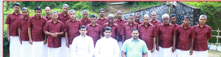
Our Inmates and Fathers at Good News Asha Bhavan, Vagamon, Kerala, India.

The situation of the mentally sick persons is very pathetic in many of our missions. They are often excluded and unwanted by families and relatives. Many of them roam around endangering their own lives as well as that of others. Even when they are able to manage with the help of treatment people are still scared of them. We care for them for the love of Jesus.