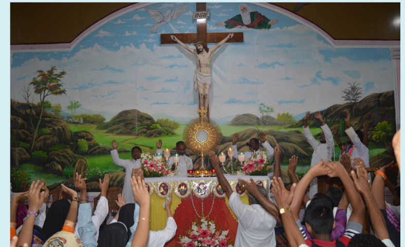
Spiritual Retreat at our Good News Retreat Centre, Pampady, Kerala, India.