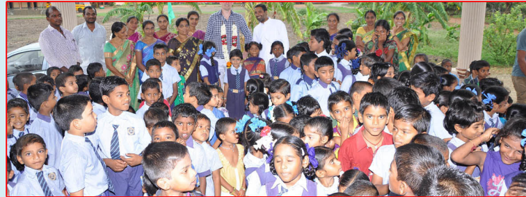
Our School Children in Bonakal Mission, Andhra Pradesh, India. (2)

With $60000 we could establish a village school. Education is their escape from the oppressive burden of poverty. Your support offers these children a bright future.