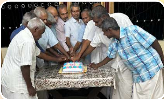
The Inmates of Good News Snehabhavan, Kakkoor, while Celebrating their Birthday Together