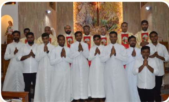
The Seminarians after Making and Renewing their Promise of the Evangelical Counsels