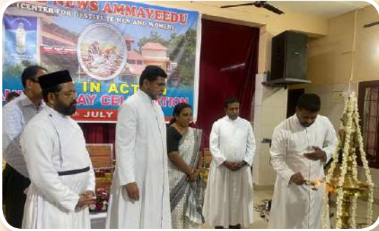
Annual Day Celebration of Good News Ammaveedu, Pampady, Kerala