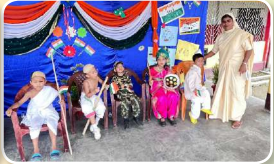
Independence Day Celebration at St. Paul's School, Dhonekhona, Arunachal Pradesh