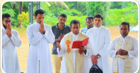
The Blessing of the New Crucifix Placed at the Entrance of the Retreat Hall in Good News Retreat Centre, Pampady, Kerala