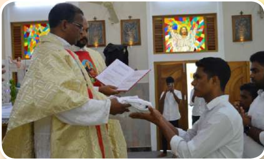
Our Brothers while Receiving the Cassock from the Provincial Superior