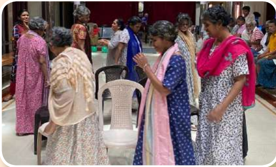
The Inmates of Good News Ammaveedu, having Onam Celebrations