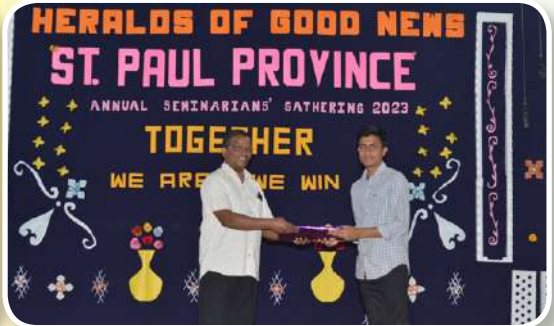
The Seminarians are being Distributed the Prizes for their Personal Achievements by Provincial Superior