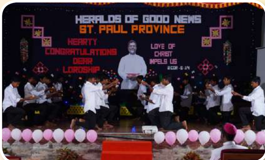
The Students at St. Paul Minor Seminary, Koratty, Kerala while Performing a Stage Show