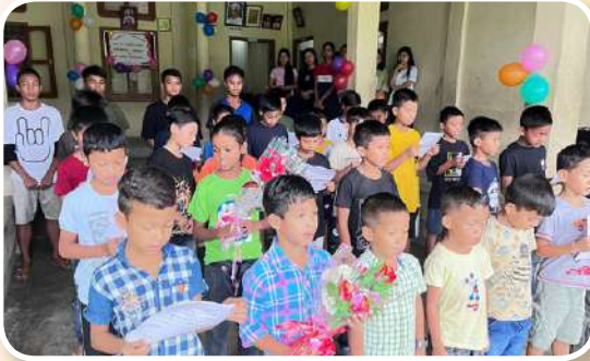
The Students of St. Paul's Hostel, Dhonekhona, Arunachal Pradesh