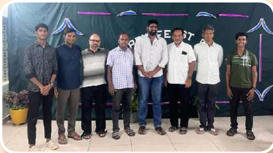
Gathering of our Fathers along with our Seminarists Studying at Heralds Spiritual Orientation Centre, Kurukuru, Andhra Pradesh