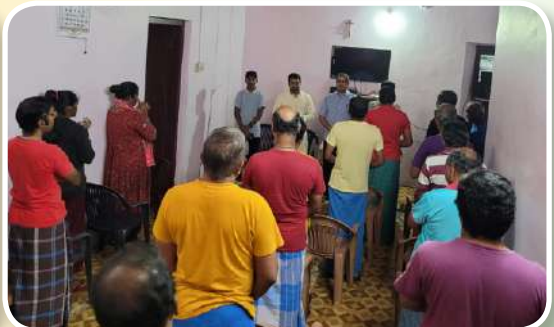
The Fathers and Inmates of Good News Asha Bhavan while having some Time Together