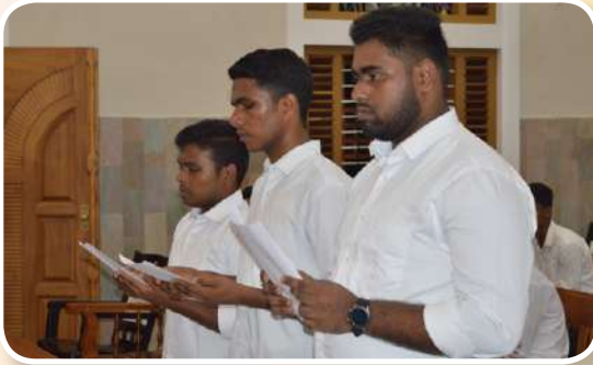
Our Seminarians while Making their First Promise of the Evangelical Counsels