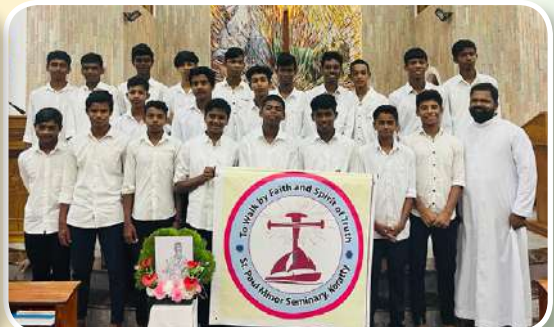
The Rector and Students at St. Paul Minor Seminary, Koratty, Kerala