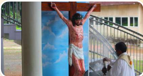
New Crucifix Placed at the Entrance of the Retreat Hall in Good News Retreat Centre, Pampady, Kerala