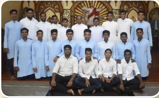
Our Major Seminarists at St. Joseph's Major Seminary, Khammam, Telangana