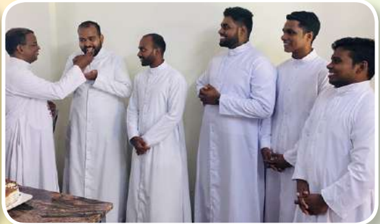
The Joy of Sharing the Cake after Having Made their Perpetual Incorporation in the Society during the Family Gathering