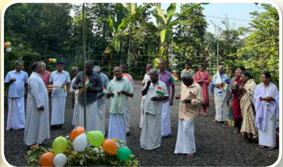
The Independence Day Celebrations at Good News Snehabhavan, Kakkoor, Kerala