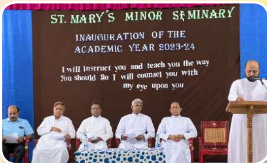
The Inauguration of the New Academic Year at St. Mary's Minor Seminary, Karunapuram, Kerala