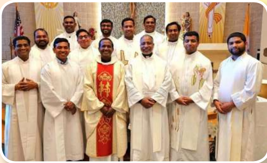
At the Celebration of Holy Mass on the Occasion of Gathering of the Pauline Family who are Working in USA