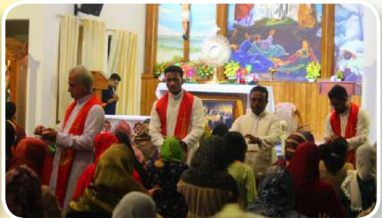
The Retreat Ministry Being Carried out at Good News Retreat Centre, Pampady, Kerala