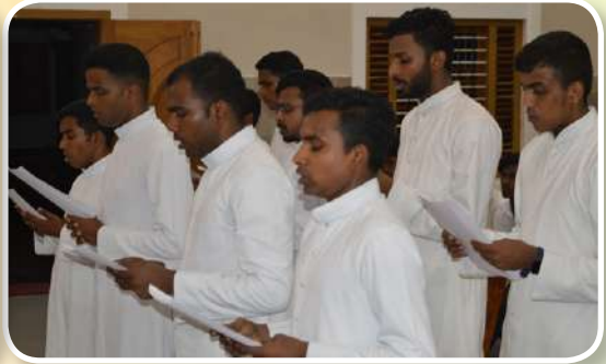
Our Theology Students while Renewing their Promise of Evangelical Counsels