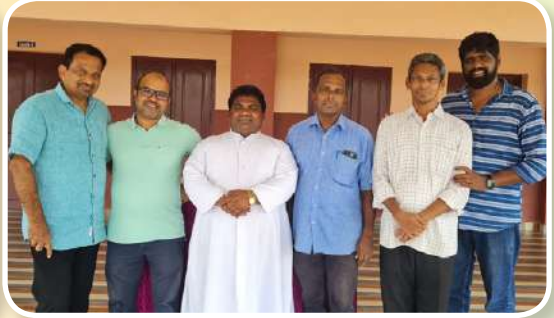
Gathering of our Fathers Working in Andhra Pradesh and Telangana for the Lenten Recollection