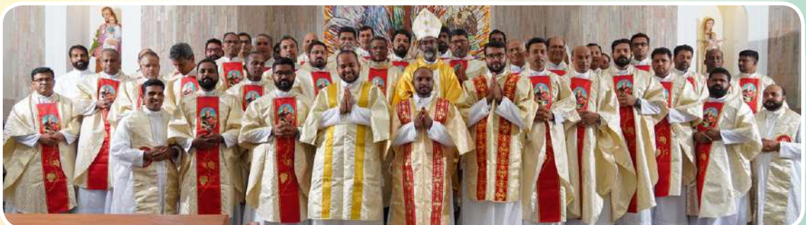
Group Photo, Taken during the Diaconate Ordination at Cenacle