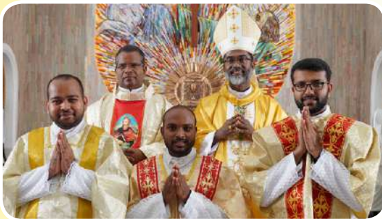
Newly Ordained Deacons along with our Bishop and Provincial Superior