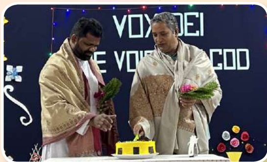
Welcoming the New Rector and Bidding Adieu to the Outgoing Rector