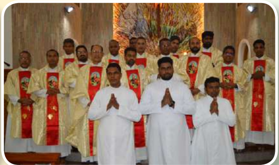
The Seminarians after Having Received the Cassock During the Annual Seminarians Gathering