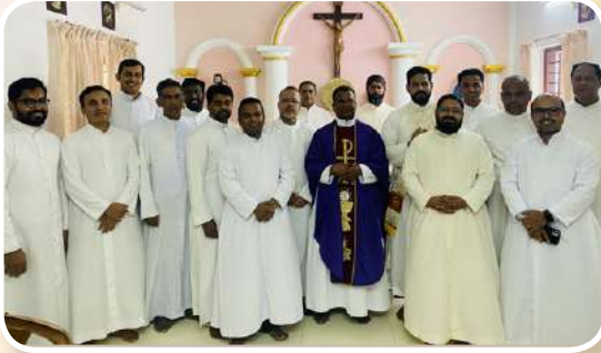
Gathering of our Fathers for the Lenten Recollection at Good News Campus, Pampady, Kerala