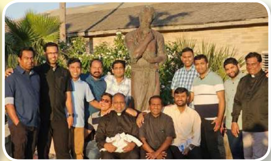
Gathering of the Pauline Family who are Working in the United States of America